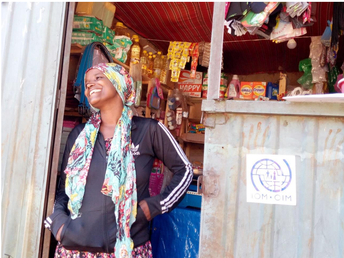
Beneficiary of Supporting Vulnerable Female-Headed Households (FHH) Through Access to Income Generating Activities programme.