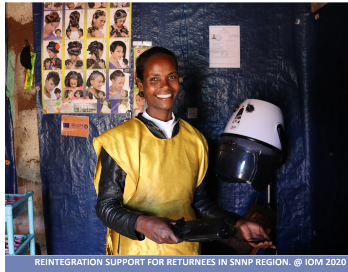
REINTEGRATION SUPPORT FOR RETURNEES IN SNNP REGION. @ IOM 2020