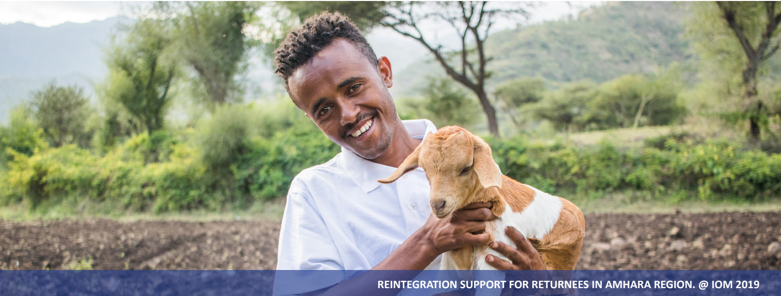
REINTEGRATION SUPPORT FOR RETURNEES IN AMHARA REGION.

The EU-IOM Joint Initiative for Migrant Protection and Reintegration in the Horn of Africa (EU-IOM Joint Initiative) is a programme funded by the EU Emergency Trust Fund for Africa (EUTF).